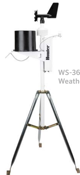
WS-360-TCP Weather Station

The Hunter Weather Station and Solar Sync Sensor deliver maximum water savings by allowing irrigation only when it's needed.