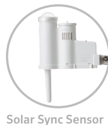
Solar Sync Sensor

Hunter 360 Software works with an unlimited number of Hunter ACC2 and ICC2 Controllers, making it easy to scale up as your system grows.