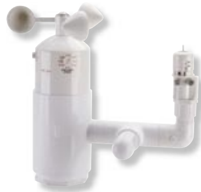
Mini-Weather Station (With Optional Freeze Sensor)

Control irrigation system operation with sensors for wind, rain, and temperature