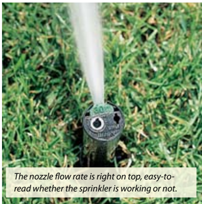
The nozzle flow rate is right on top, easy-to-read whether the sprinkler is working or not.