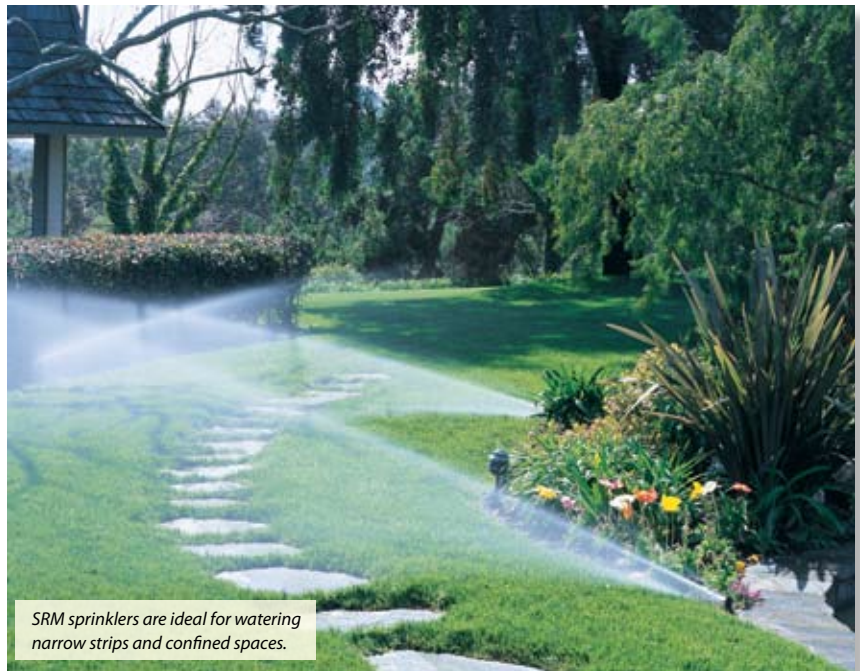
SRM sprinklers are ideal for watering narrow strips and confined spaces.