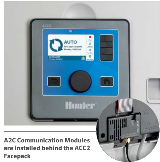
A2C Communication Modules are installed behind the ACC2 Facepack