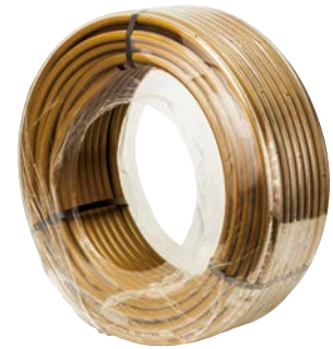
Coil with Stretch Wrap