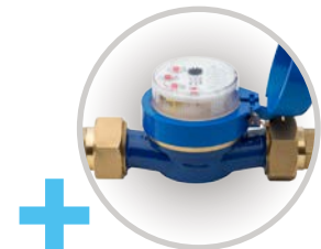
Add optional flow meter for flow alerts and monitoring water consumption