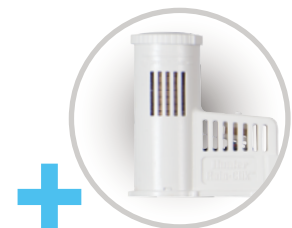
Add a Rain-Clik® for improved protection and onsite shutoff