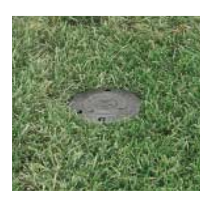
6. A clean & simple conversion in minutes!