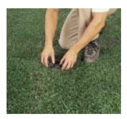
5. Snap the retaining ring in place.