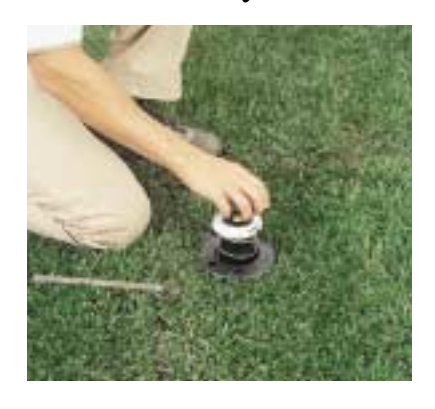
1. Remove internal assembly of existing sprinkler.