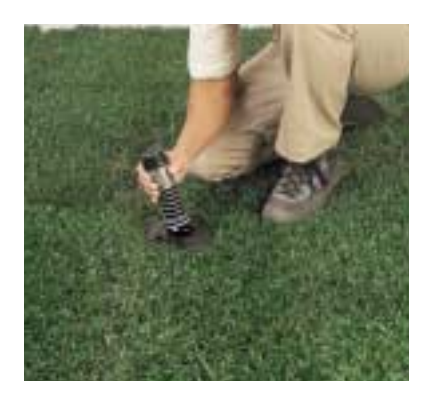
4. Insert pop-up riser assembly.