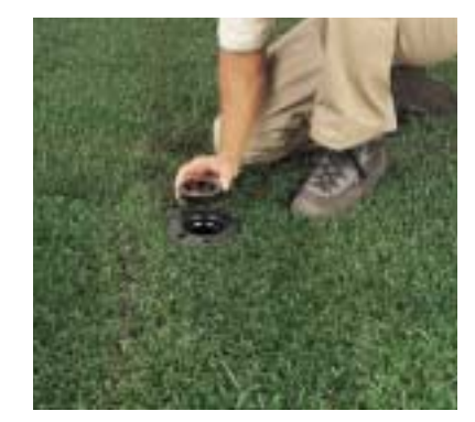
3. Thread on adapter cap and securely tighten.