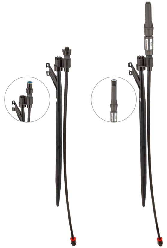
MP-STAKE Total height: 28" Male threaded connection: ½"