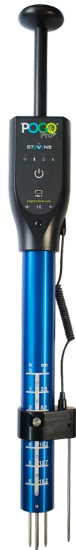
POGO Pro+ Probe

*You must have an active POGO TurfPro Cloud account to connect.