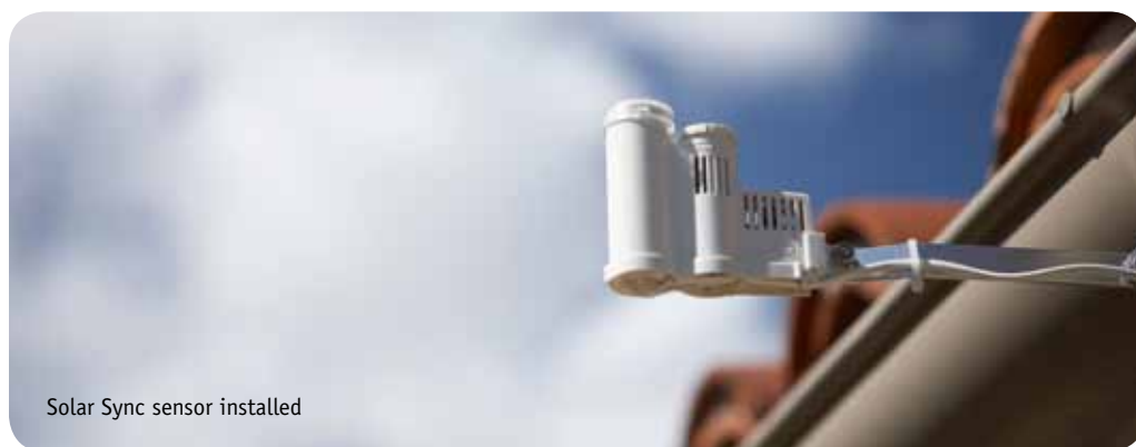
Solar Sync sensor installed