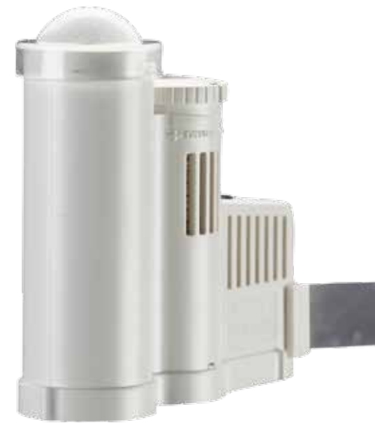
Solar Sync sensor