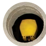
① Quick Coupler

All ST Vaults include convenient quick-access ports. Quick couplers provide a convenient source of water for washing down spills and water-soluble paint. The integrated in-vault design eliminates the need for additional quick-coupler enclosures.